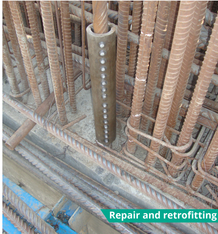
Repair and retrofitting