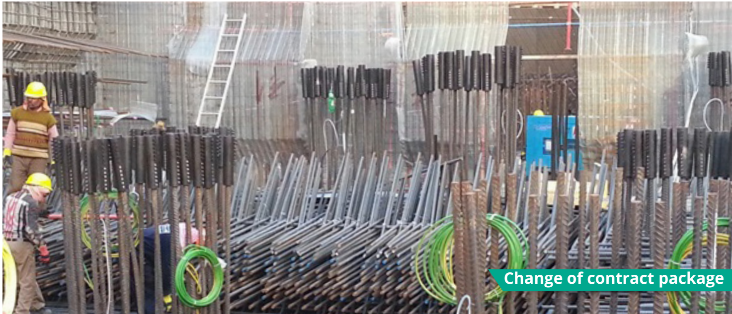
Change of contract package